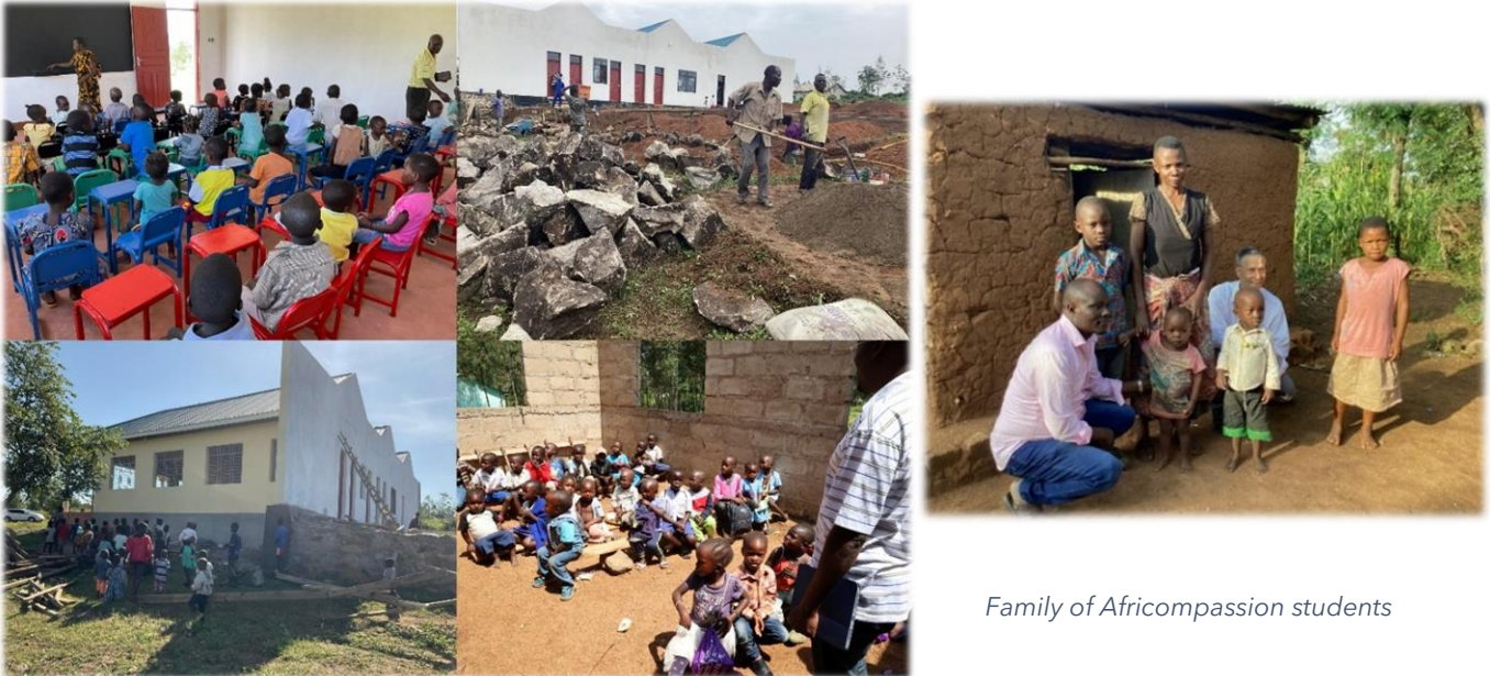
Family of Africompassion students

We have been blessed to raise sufficient funds to begin construction of the second half of the building consisting of three additional classrooms and a connecting courtyard, which will add about 5,000 square feet of space to the building.