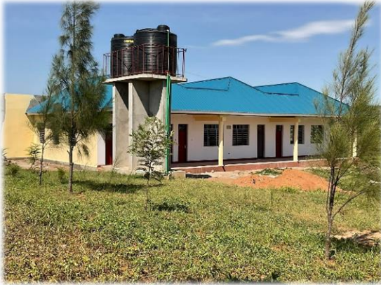
School construction video: https://bit.ly/afco-school