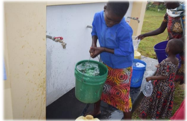
Village water project video: https://bit.ly/afco-water